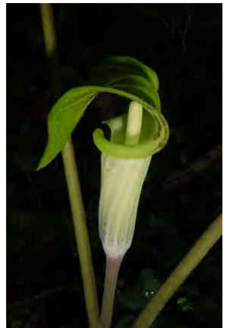
Jack-in-the-pulpit, Arisaema triphillum